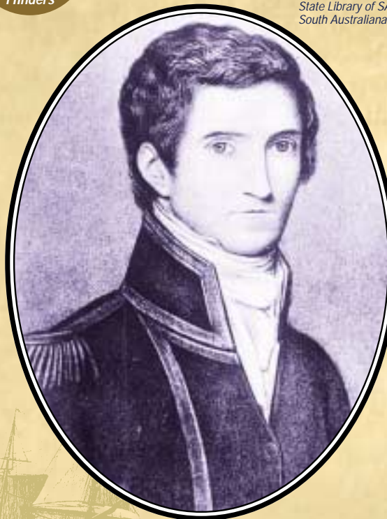
B 16400 Captain Matthew Flinders

In November, examination of the Investigator found that much of its timbers were rotting. Further repairs allowed the Investigator to keep sailing, but by March 1803 the ship was in such poor condition, and the crew in ill-health, that the survey was halted. The Investigator visited Timor for supplies, and then returned to Port Jackson down the west coast and across the Great Australian Bight. In reaching Port Jackson, he had completed the journey around the southern continent.